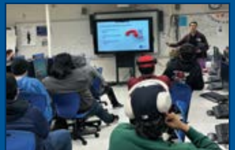
Employment Preparation Workshops