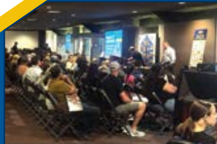
Parent and Student Career Planning