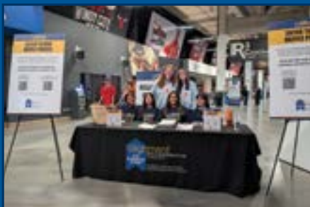
Elgin Neighborhood Network