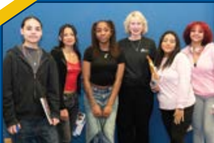
Youth Empowerment Program