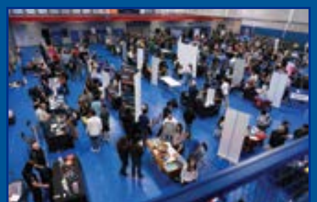
Regional Job Fair