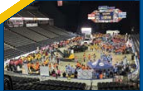
EXPLORE - 8th Grade Career Exploration Day